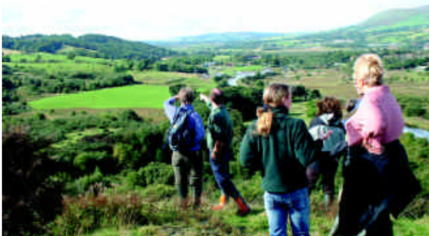
Taking in the view from Nethercroy

Footpath links have already been improved and this will continue with the renewal of the 'Soon Cut' from Croy to Auchinstarry Basin. An improved link from Nethercroy will be made up to the old railway path, and the railway path will be linked to Dullatur. The old path along the south bank of the canal to Craigmarloch will be improved in keeping with the natural landscape.