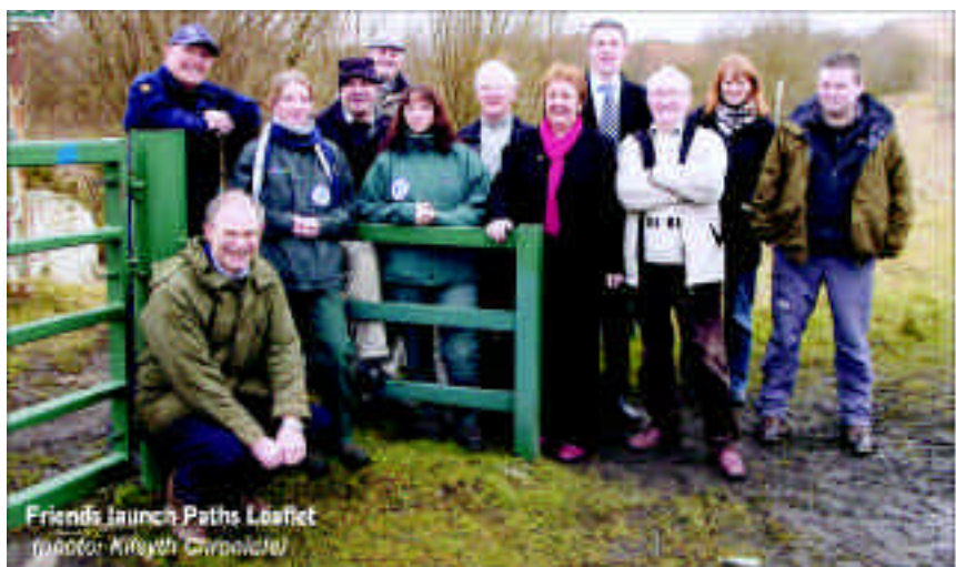
Friends launch Paths Leaflet

LATE NEWS: We have just heard that Kilsyth has now been accredited as a Walkers are Welcome town, the second in Scotland to achieve this landmark new status.