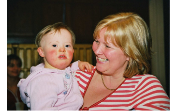
West of Scotland Branch Easter Party, Colzium House – more photos at www.downswest.org.uk